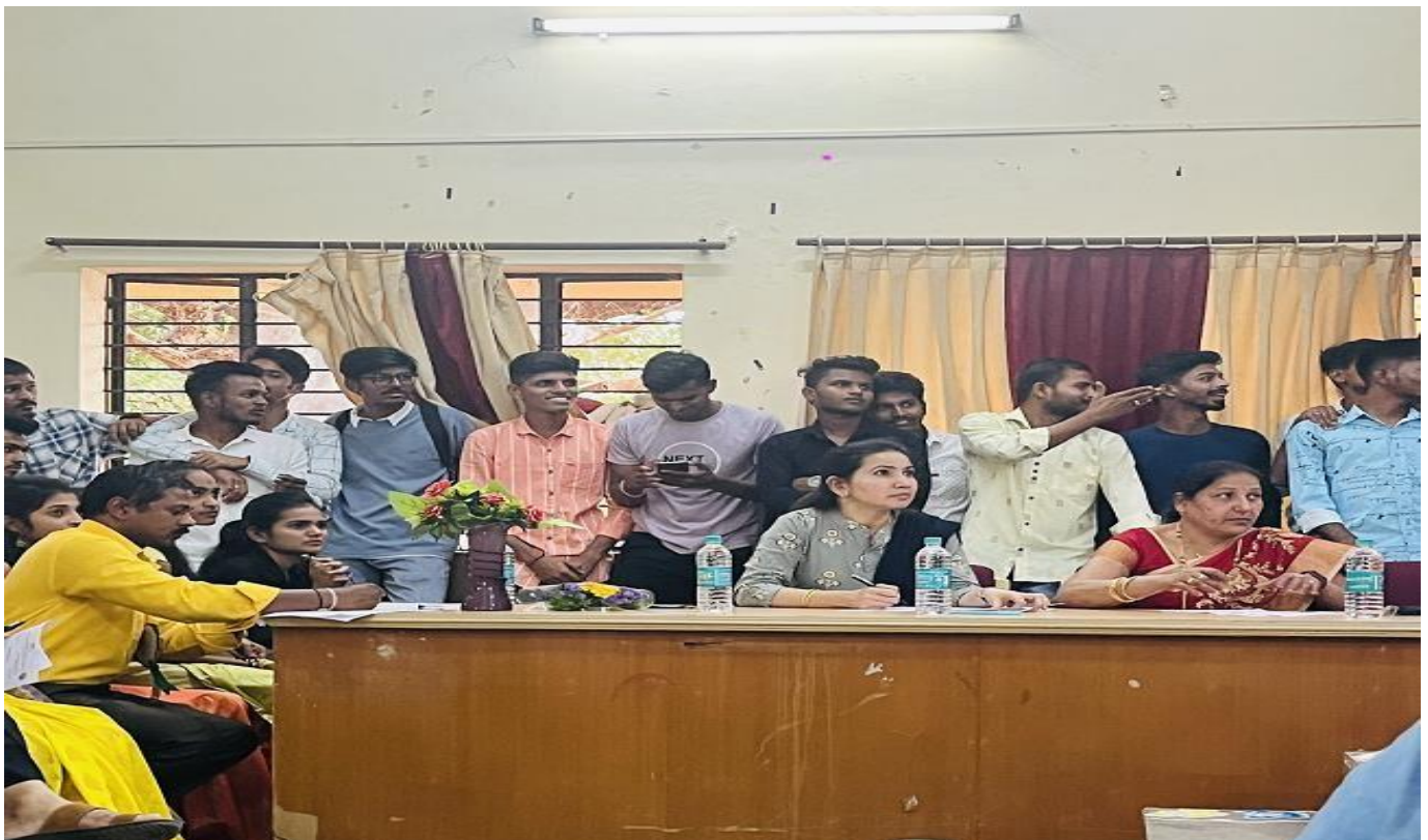
Juries observing the performance of the students