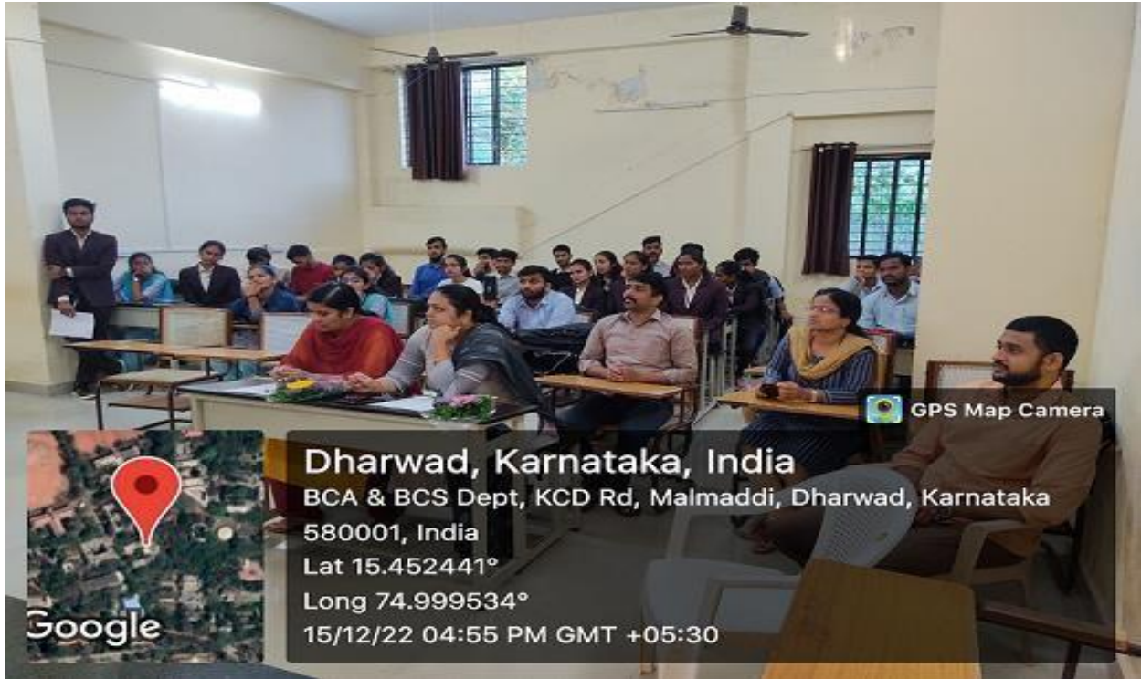
Judges observing the act