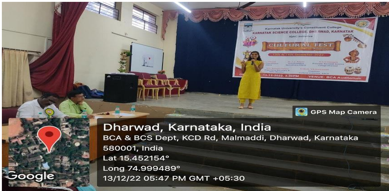
Student performing a song