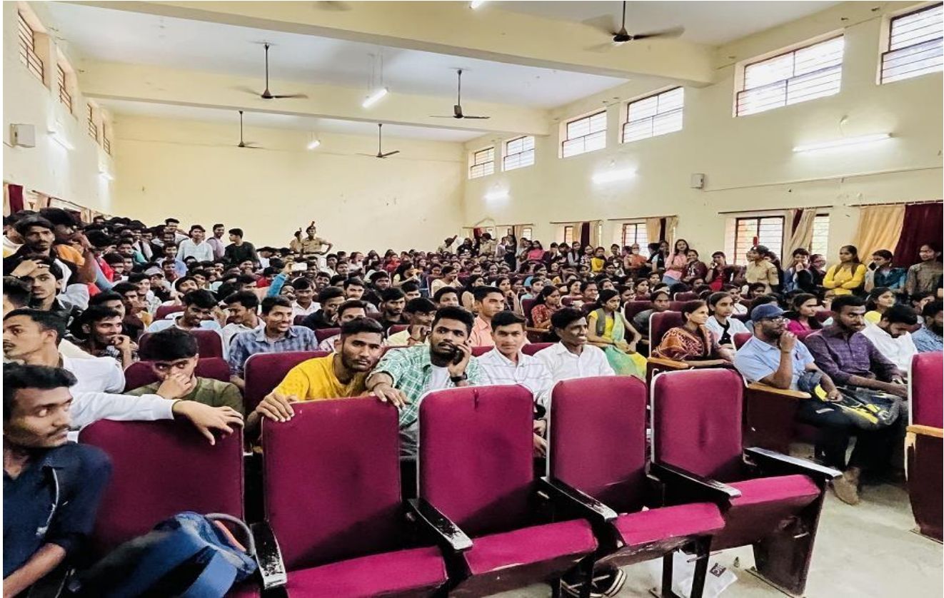
A view of Audience watching Dance performance