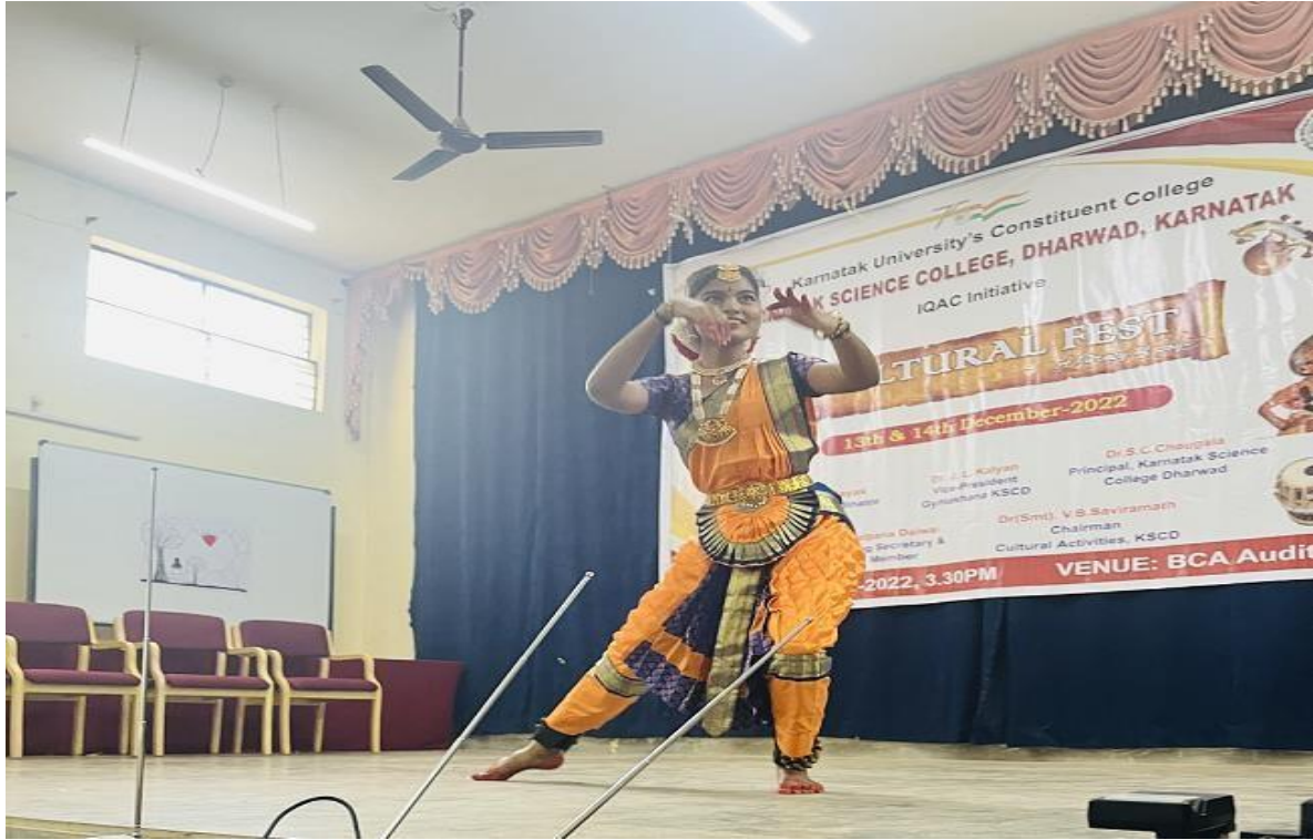
Student performing Bharatnatyam