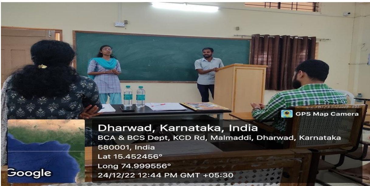
Student Performing Mimcry