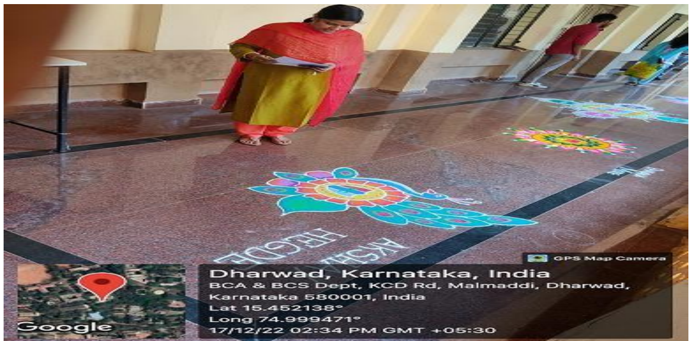
One of the Jury observing the Rangoli