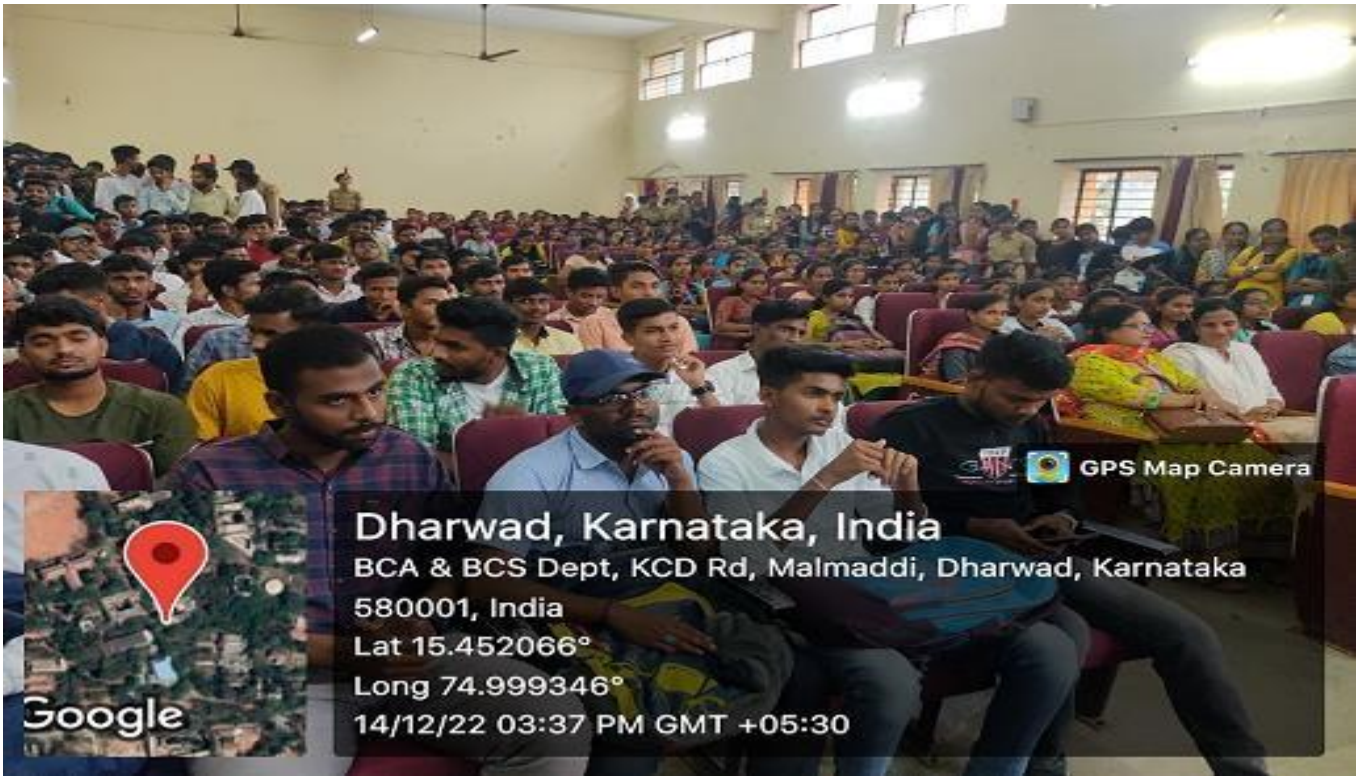
Audience attended Cultural fest