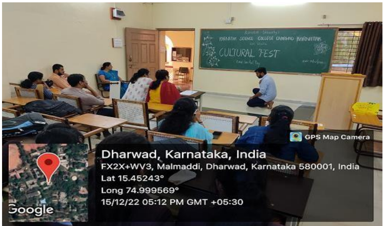
Student performing One act play