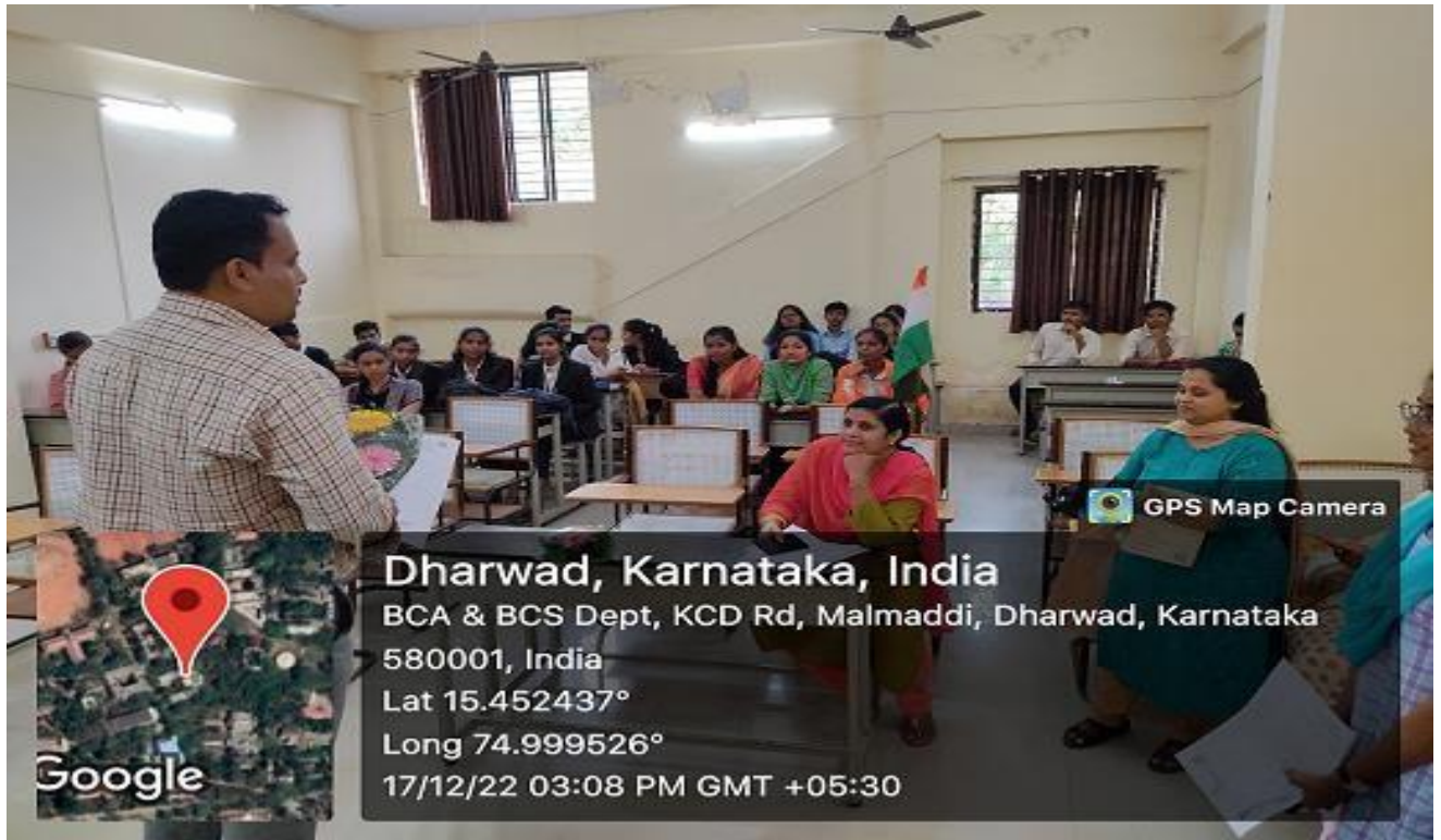
Staff member announcing the rules before starting the events