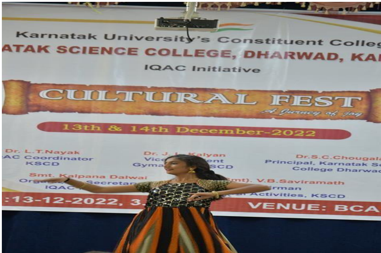
Students performing a Dance