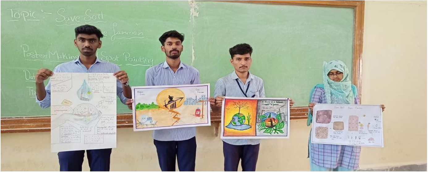
Student exhibiting by way of Spot painting and Poster Making