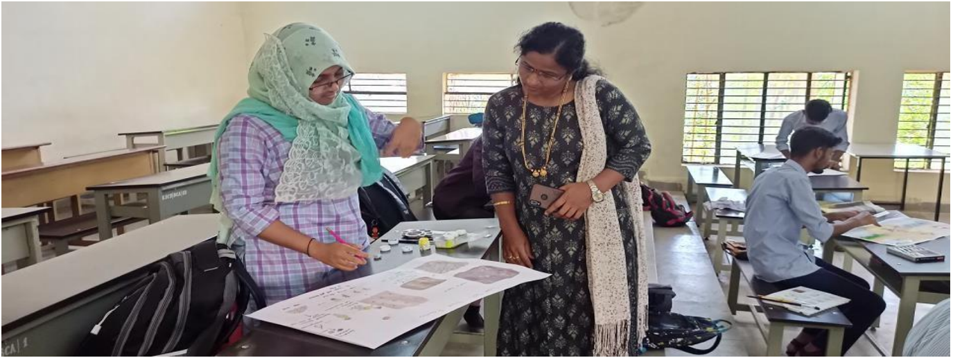
Spot painting and Poster Making Competition.