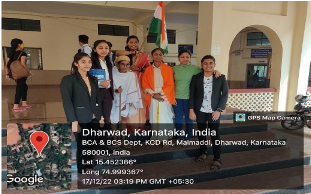
Drama and Mime Competition